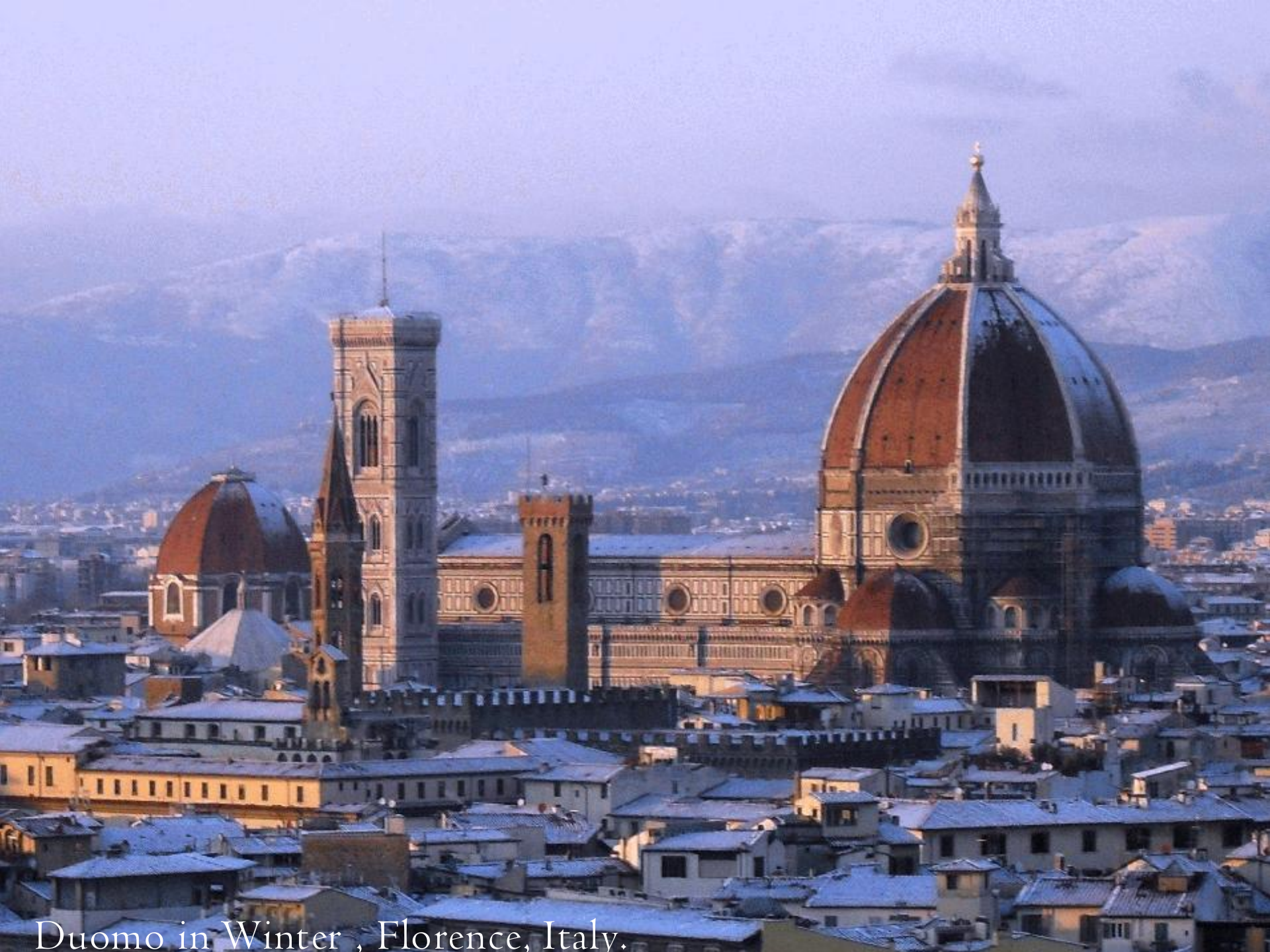
Duomo in Winter , Florence, Italy.