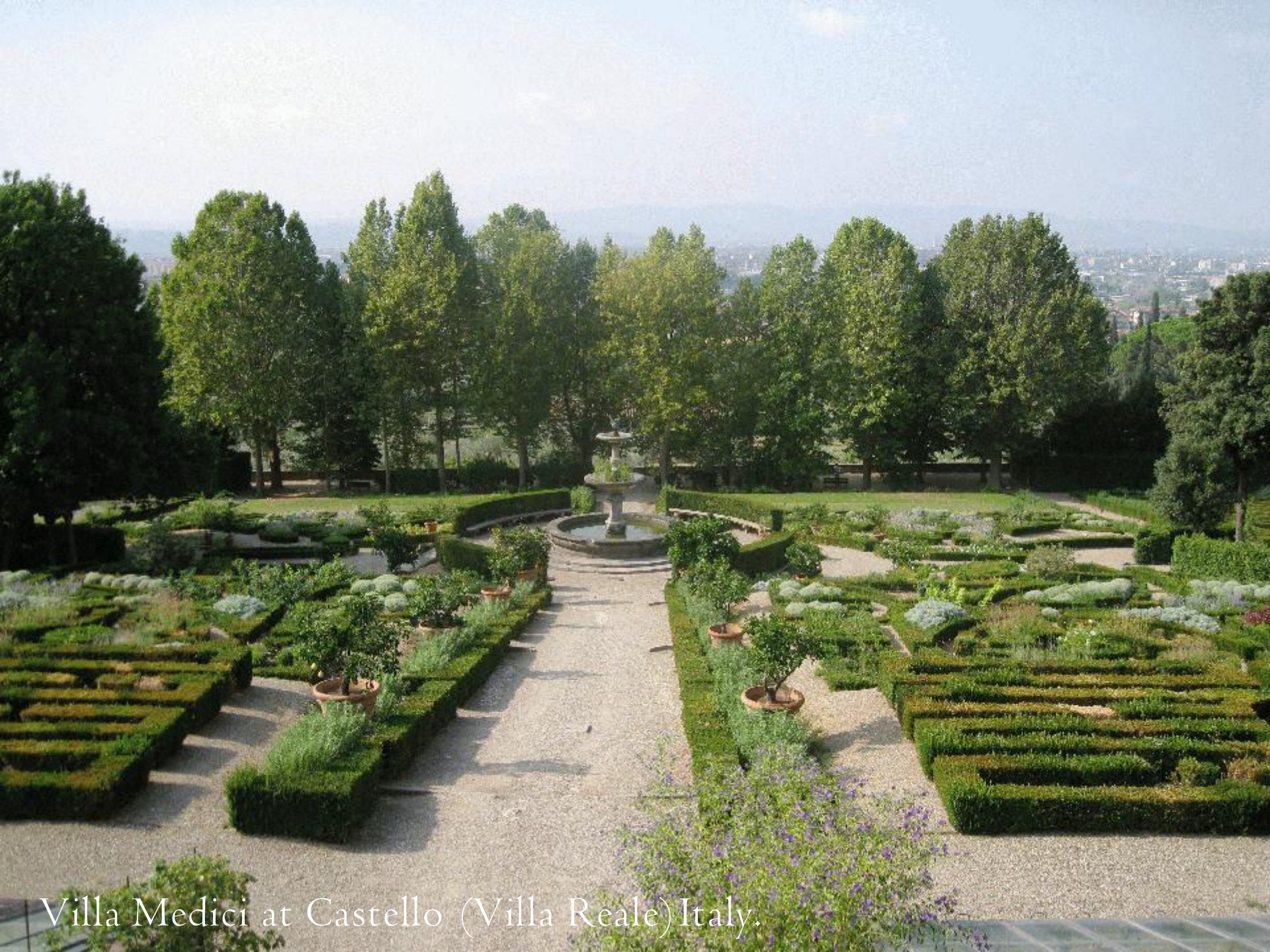
Villa Medici at Castello (Villa Reale) Italy.