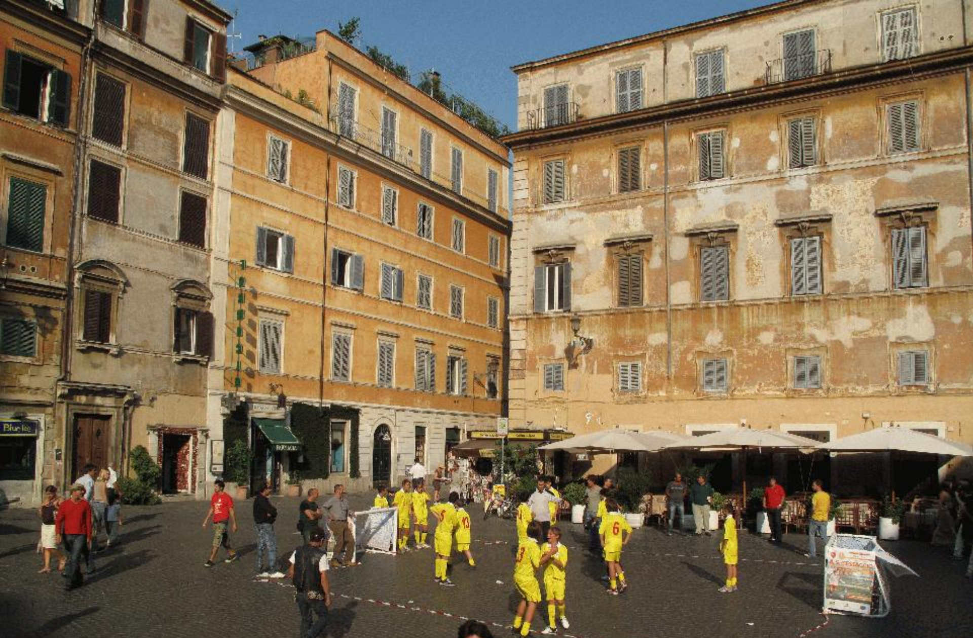
Travel Abroad 2009-2010, Lawrence Tech./Kent State Florence Program; People, Places and Perceptions.