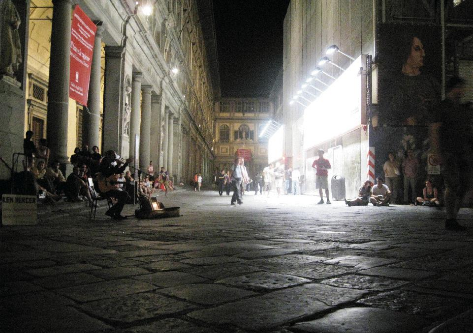
Palazzo della Signoria at night, Florence, Italy. Scene.