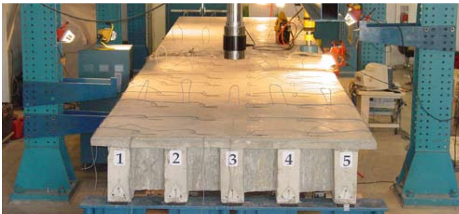
The Center for Innovative Materials Research (CIMR) is testing a girder-type highway bridge model meeting specifications of the American Association of State Highway Officials (AASHTO) in which steel has been replaced by carbon fiber reinforced polymer (CFRP) composite materials. The research is sponsored by the U.S. Department of Transportation.