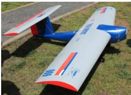
Papa Smurf was Lawrence Tech's entry in the SAE Aero Design East Competition held in Georgia in April.

On the other hand, aircraft dimension constraints change each year. For example, some years a maximum wing span is allowed; other years a minimum wing span is allowed. This